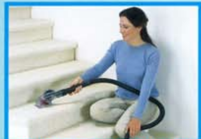
Turbine driven Turbobrush lifts out deep down dirt on carpets...